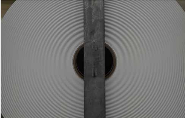
WA1701_1 The wave pattern is created because the roll is inconsistently wound — the roller oscillates back and forth.