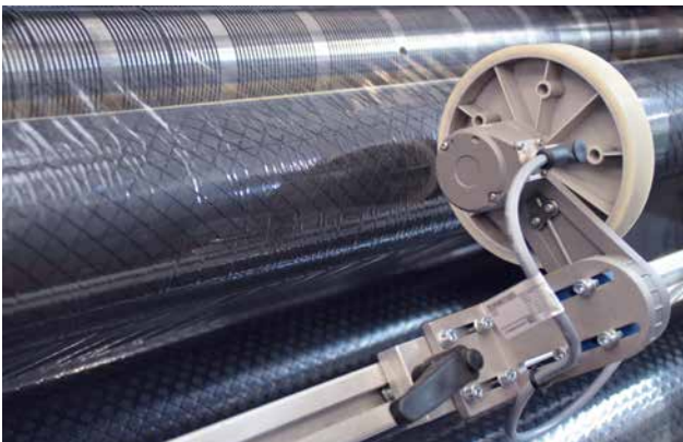
WA1701_2 The contact pressure of the spring arm from Wachendorff Automation can be adjusted. With the aid of the markings, Constantia's fitters can find the perfect pressure for their task right away.