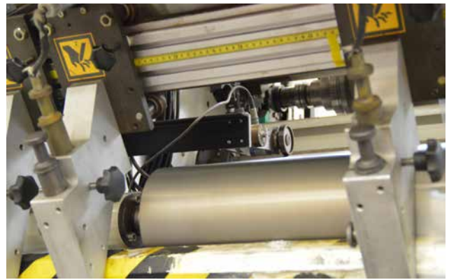
WA1701_4 Technology from Wachendorff Automation is also used on the extruder. Here, the rotational speed is taken directly from the roller. This made it possible to mount the encoder differently, since it is not in the way when changing the rolls.