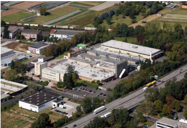
WA1701_8 The twisted sweet wrapper was invented at the Wiesbaden site