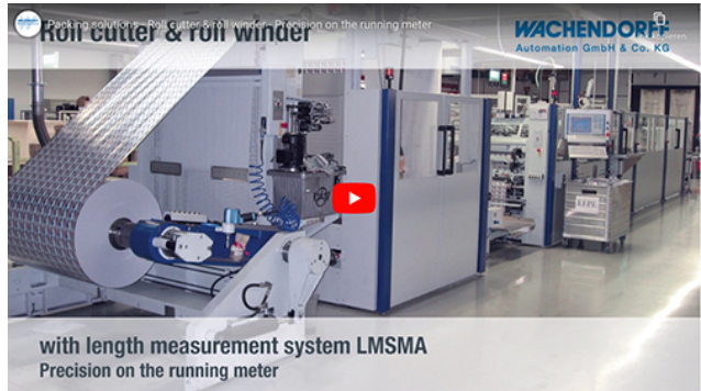
Video: Length measurement system LMSMA in use. You will be forwarded to the Wachendorff Youtube channel.

Any Questions? Just call +49 (0) 67 22 / 99 65-414, support-wdgi@wachendorff.de or call your local distributor: www.wachendorff-automation.com/distri