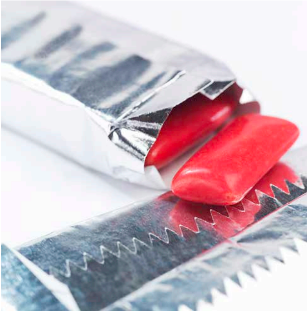
WA1701_7 Chewing gum wrappers: a typical Constiantia Flexibles product