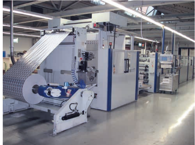
WA1701_9 The films are produced, finished and cut on large machines.