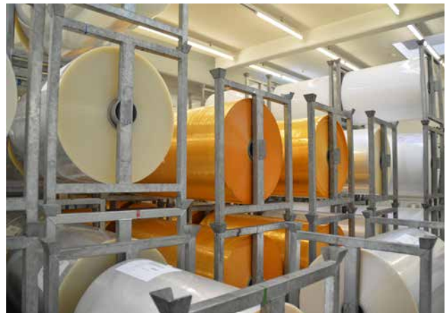
WA1701_5 A wide range of different films are available in the warehouse. They are refined and finished in accordance with customer specifications.